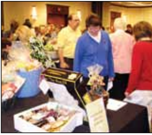
The third annual Breakfast with the INN Crowd event had a record year, raising $35,300 to benefit Room at the Inn.